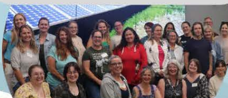
DAY 5-SONOMA CLEAN POWER Switching to renewables