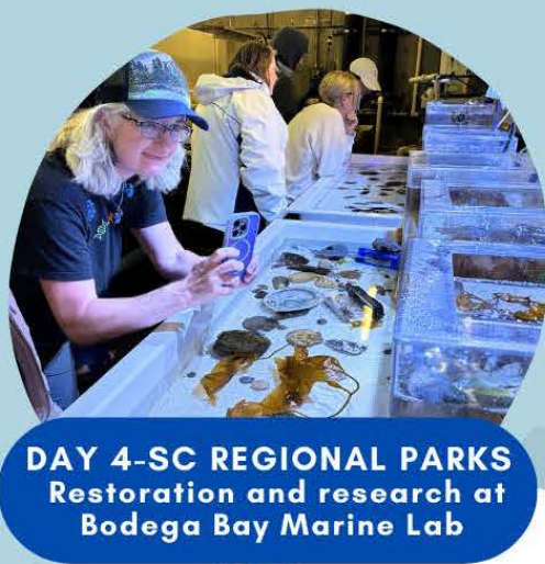
DAY 4-SC REGIONAL PARKS Restoration and research at Bodega Bay Marine Lab