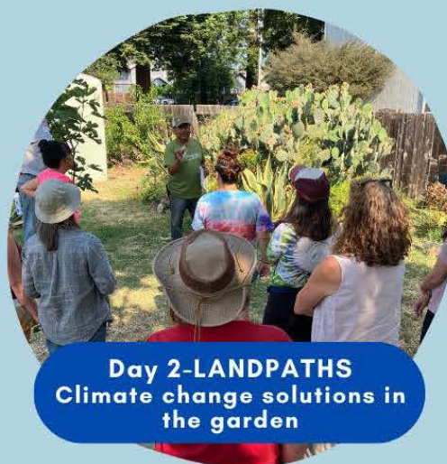
Day 2-LANDPATHS Climate change solutions in the garden